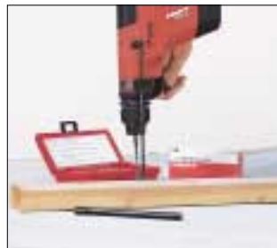
Drill a hole 1/2" deeper than the required screw penetration.