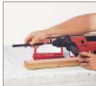
Change the rotary hammer setting to rotation only. Lock the compact setting tool over the special detent receiver on the bit.