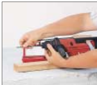
The Kwik-CON II+ fastening system is convenient to use. Simply insert the carbide-tipped SDS+ or TM bit directly into the rotary hammer. No special adapters are needed.

For individual item description, see ordering information listed below.