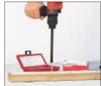
Adjust the depth location and set the screw.