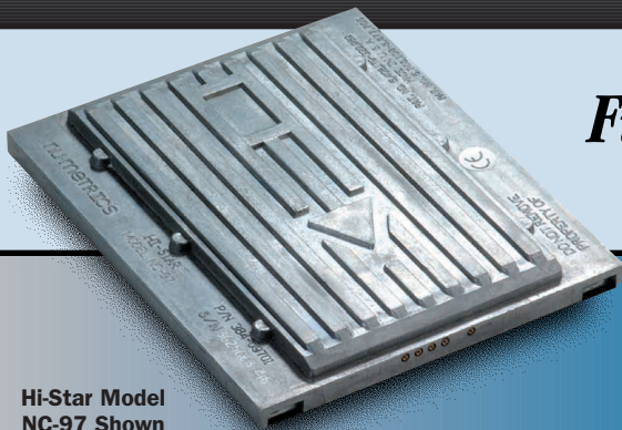
Hi-Star Model NC-97 Shown

Are your school zone safety signs and speed signs working?